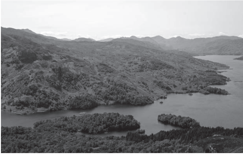
Plate 5: Loch Katrine: Bealach nam Bò, Coire na(n) Ùrnisgean and Eilean Molach. (Bealach nam Bò is the break of slope in the left background below the rock face, Coire na(n) Ùrnisgean is above the steamboat and Eilean Molach is at the bottom right) (also in colour section)

in the process of landscape change. The model cannot accommodate the excision of Gaelic and its culture from most of the Gàidhealtachd. What remains is a toponymic layer representing a psycho-geography, which is frozen in time and detached from subsequent possible representations of the landscape. It is as if a chapter in the book of this landscape has been lost or erased. Such a notion is similar to the geological concept of non-conformity, where, though rock types may be physically contiguous, they are discontinuous in time.